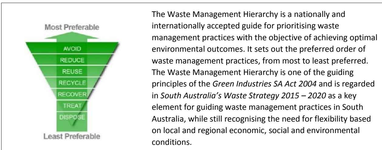
Figure 2: Waste Management Hierarchy