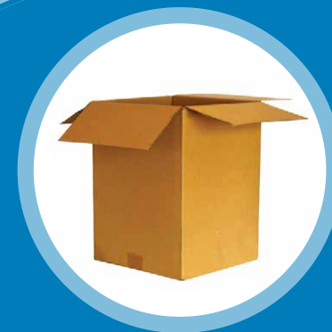
Cardboard boxes (fold and place next to bin)