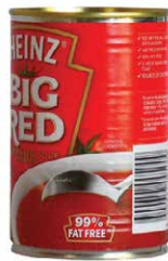
Can and tins