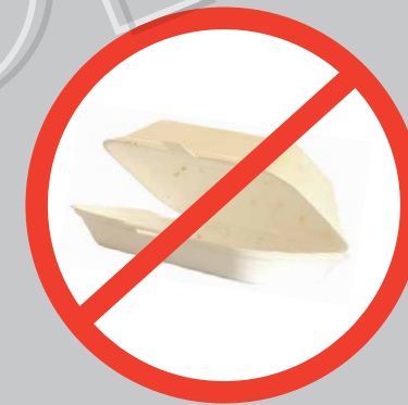
Foam and polystyrene