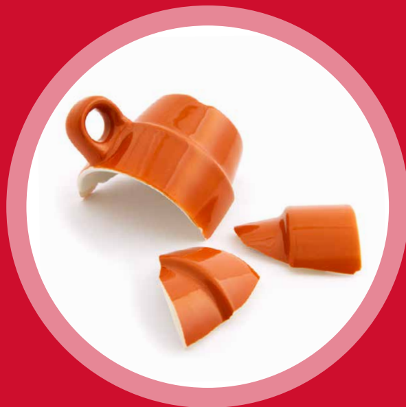
Crockery (wrapped in paper)