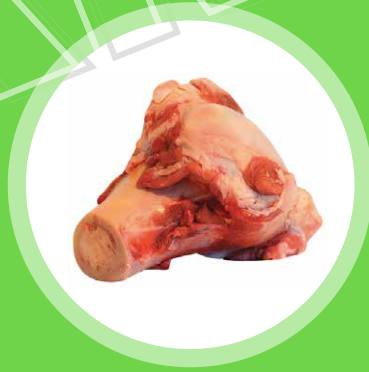
Meat and bones