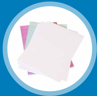
All office paper (white and coloured)