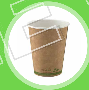
Compostable coffee cups and lids