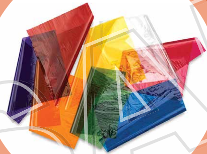
Flexible plastics (cellophane)