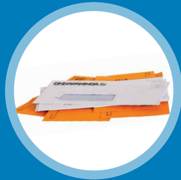
All envelopes (including windows)