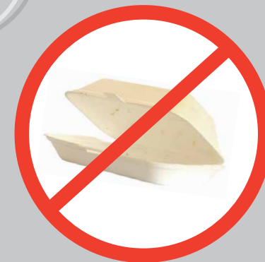
Foam and polystyrene