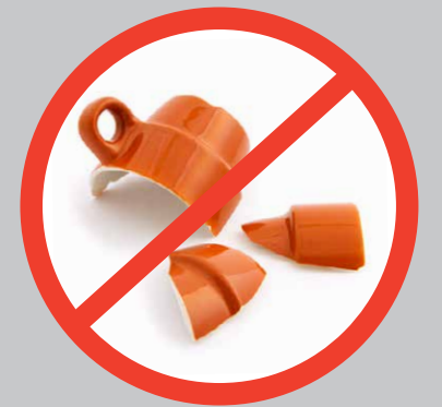
Household crocery and glassware