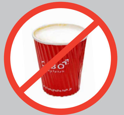
Non-compostable coffee cups