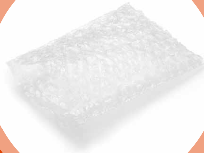
Flexible plastics (bubble wrap)