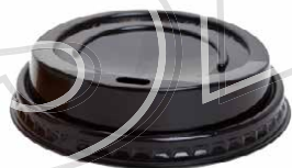
Disposable cup lids