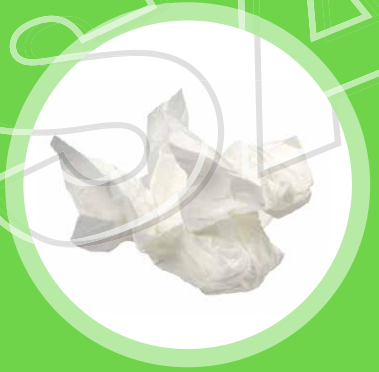
Tissues and hand towels