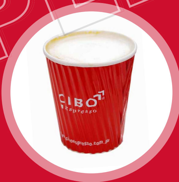
Disposable coffee cups