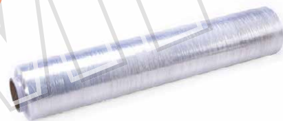
Flexible plastics (packaging wrap)