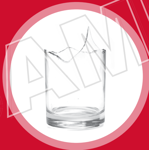
Broken glass (wrapped in paper)