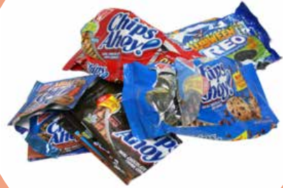
Plastic food wrappers