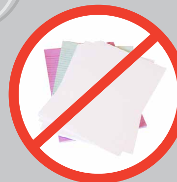
Paper and card