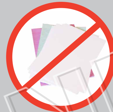
Paper and card