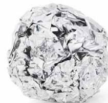
Aluminium foil containers / wrap (clean and balled)